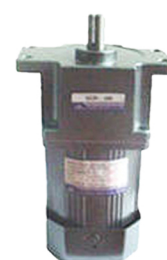
Model : 26120