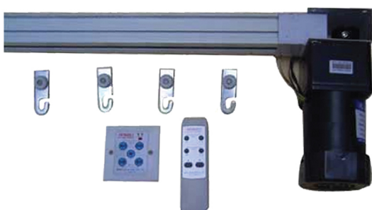
Model : 2655