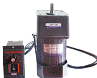
Model : 2680