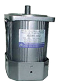
Model : 26150